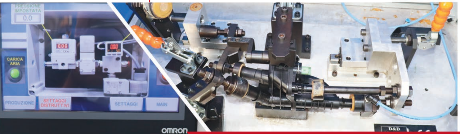
Control welds test

Don't forget! Besides thermostat flanges, Original Birth offers a wide range of products: coolant system components, steering and suspension parts, engine mounts, strut mounts, gear box mounts, axle and steering boots, wheel hubs, pedals, EGR Valves and much more.